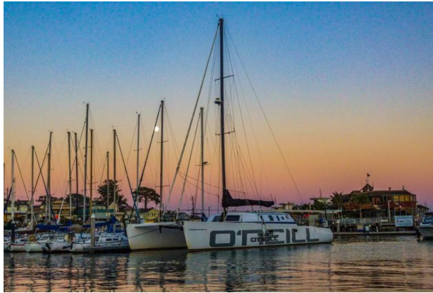
South harbor sunset, overlooking the O'Neill catamaran and Crow's Nest Restaurant

Gasoline: $4.35 Diesel: $3.59 Commercial Diesel: $3.49