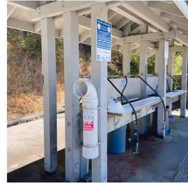
V-Dock Fish Cleaning Table

Fishing line that is improperly disposed of or abandoned in the environment can lead to numerous issues. The line not only causes damage to vessels but also entangles and endangers wildlife. Even when the line is disposed of in trash bins, it still goes to a landfill, creating the same hazards for wildlife. Since the line is NOT biodegradable, it remains in the environment for years. To address these issues, fishing line recycling containers are available to boaters and anglers throughout the harbor to properly discard their used line.