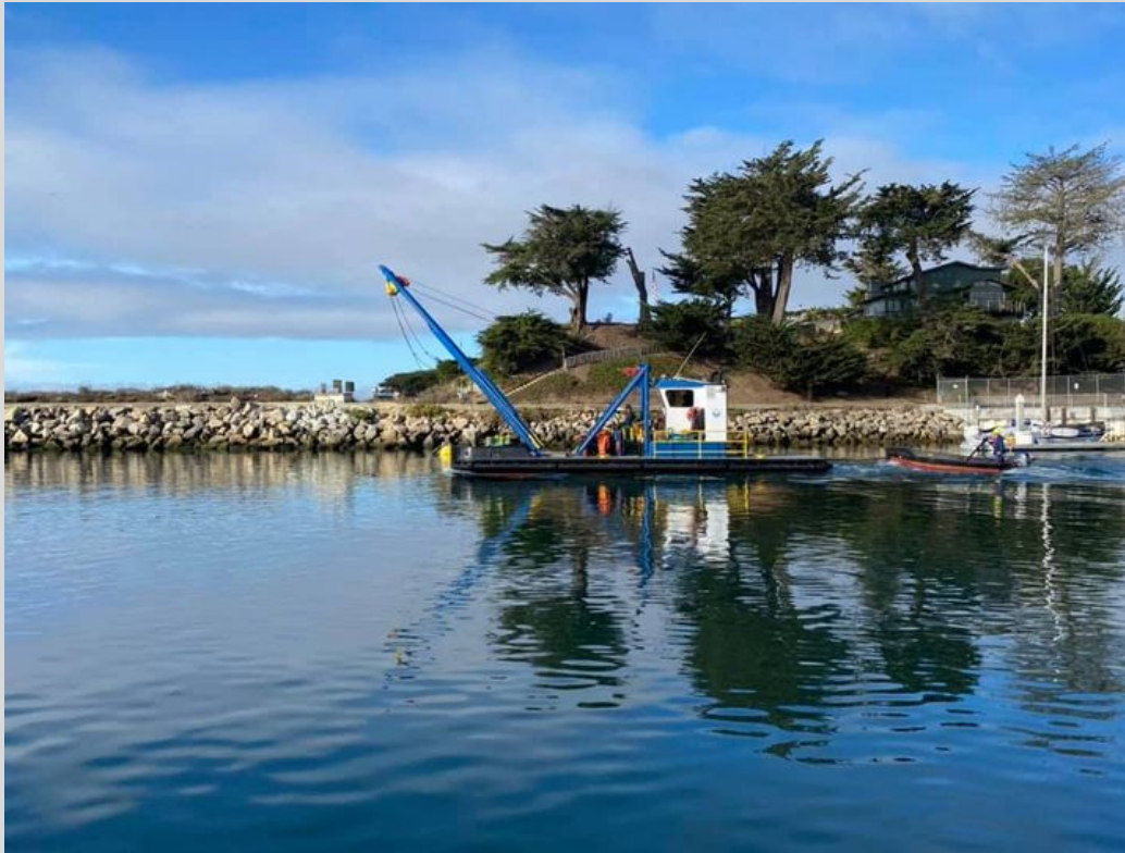
Pictured above the District's workboat Dauntless

unless otherwise marked. Stay at least 50' from the dredge. When dredging is underway, contact the crew for passing instructions on VHF channel 8.