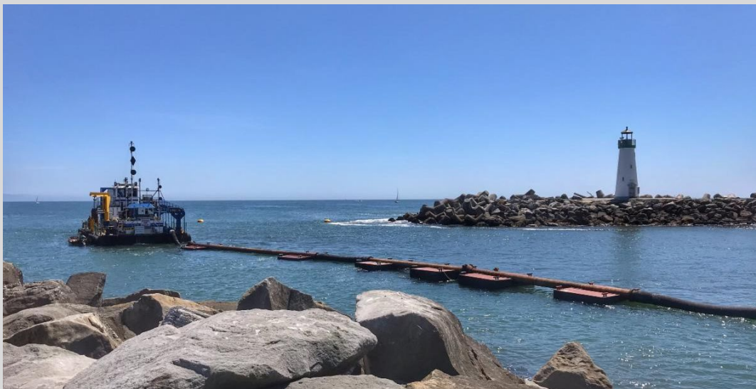
Pictured above the District's dredge " Twin Lakes "

Please read all gate notices and beware of submerged pipe and equipment hazards when operating in the area. Harbor staff will be in contact with boat owners who may be in areas slated for dredging.