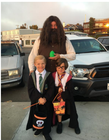
HAGRID, HARRY POTTER & DRACO MALFOY