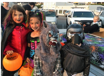
VAMPIRES, WEREWOLF & DARTH VADER