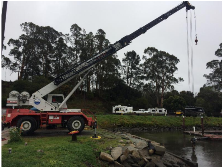
TOYO PUMP OPERATING IN THE NORTH HARBOR

North harbor dredging of coarse-grained material (greater than 80% sand), is permitted through April 30, 2018.