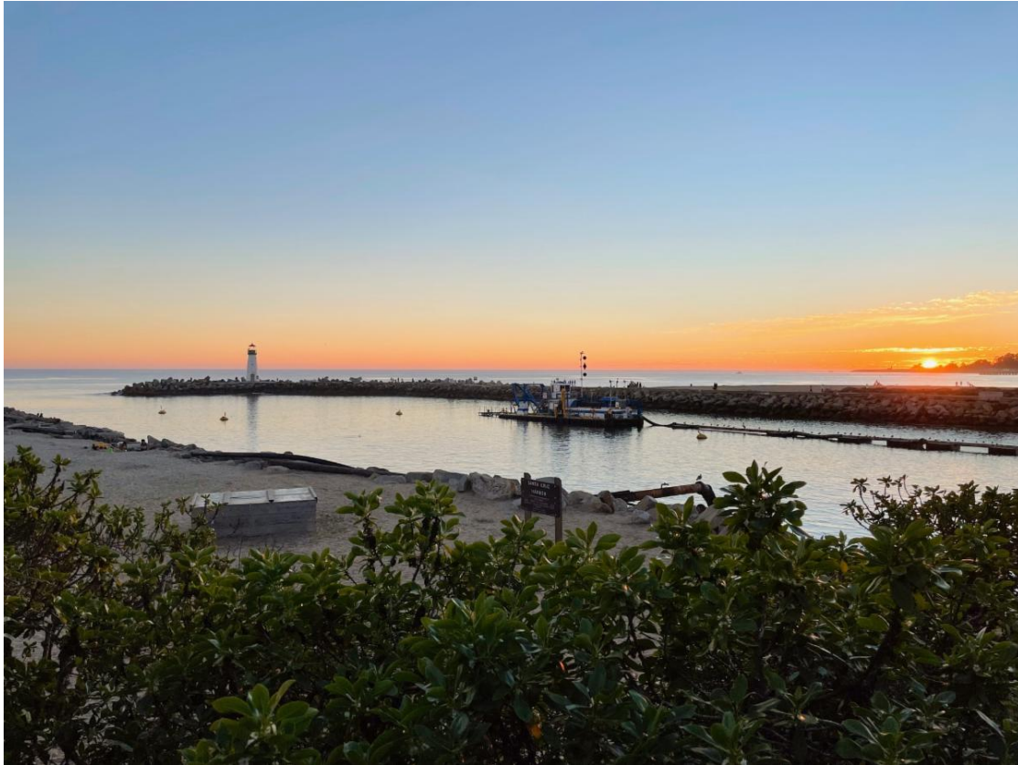
Pictured above, the District's dredge Twin Lakes at sunset on January 10, 2022.

Entrance soundings will be updated bi-weekly and posted on the District's website . During dredging operations, pass Twin Lakes on the east side (Crow's Nest side) of the channel unless otherwise marked. Stay at least 50' from the dredge. Contact the crew for passing instructions on VHF channel 8.